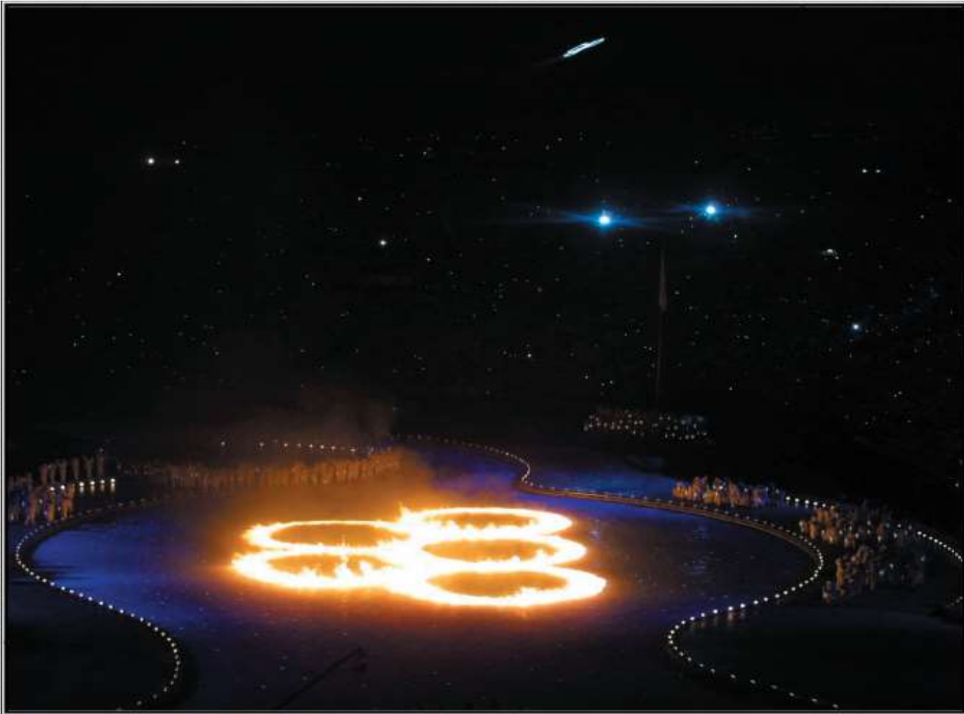
Opening Ceremony • Salt Lake City, Utah • Home of the 2002 Winter Olympics